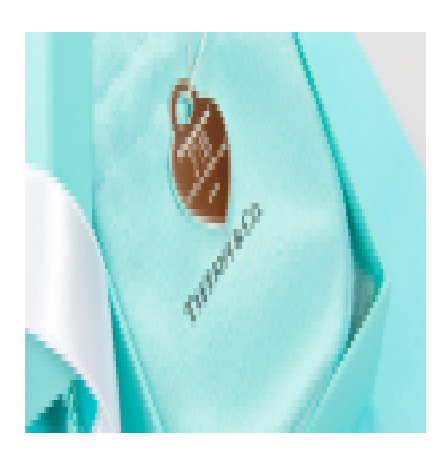
The Studio's 2014 Contest Winners!